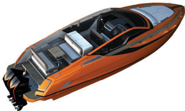
SUN BURNT ORANGE

Choose the colour you desire, whether it's one shown here or your own choice, and your F//LINE 33 will become wholly yours.