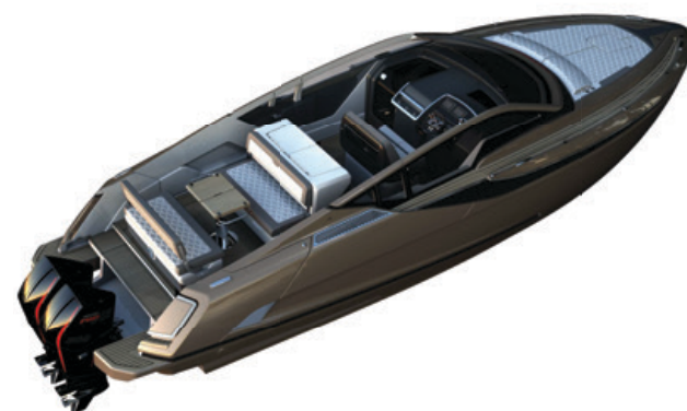
ASHEN METALLIC GLOSS