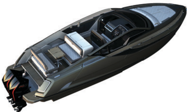
SATIN DARK GREY