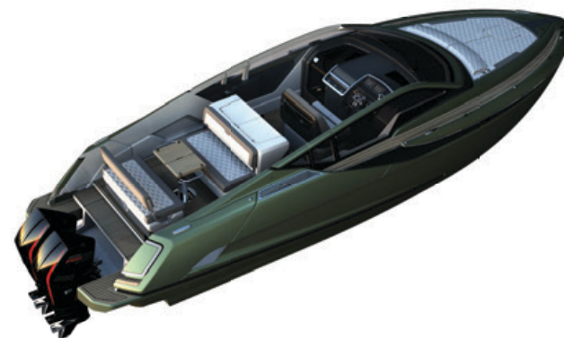
MATTE PINE GREEN METALLIC